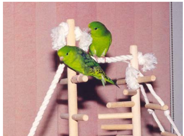
Left: Mr. Green Jeans. Top: Scooter. Bottom: Scooter and Peanut.