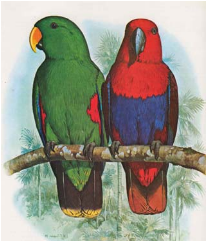
Above: male and female Eclectus. Illustration by William T. Cooper, from Parrots of the World by Joseph M. Forshaw.

Females are very conspicuous against canopy leaves and are moderately conspicuous against tree trunks. Until they are confined to the nest during egg incubation, females will call and display outside of their nest hole to let other parrots know that the nest is taken. Their bright red and purple coloring helps them stand out very well and this serves as a signal to other parrots that the nest hole is taken.